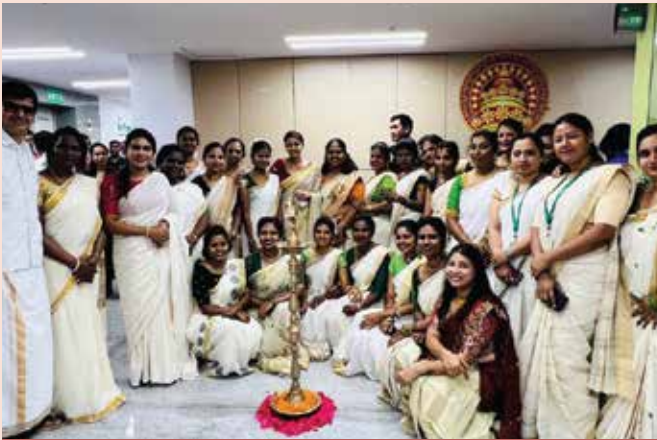
Fortis Nagarbhavi, Bengaluru