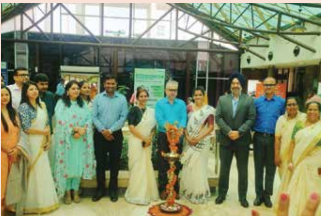
Fortis Hospital, Noida