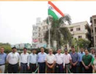
Fortis Escorts Hospital, Jaipur