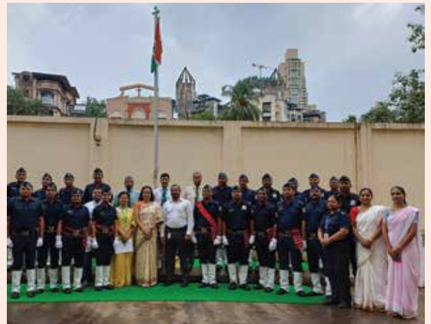
Fortis Hospital, Mulund