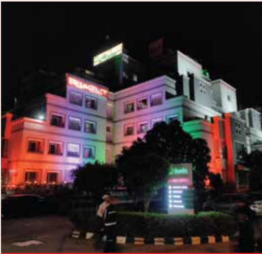
Fortis Hospital, Vasant Kunj, New Delhi