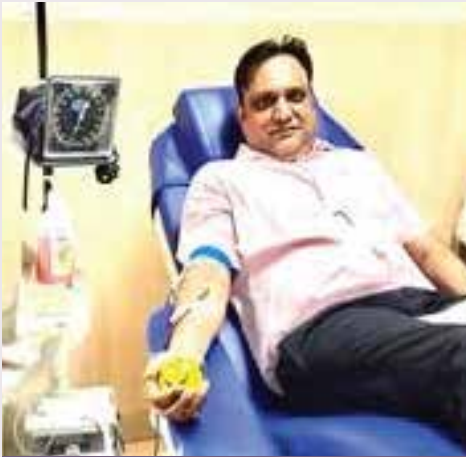
Glimpses from the event