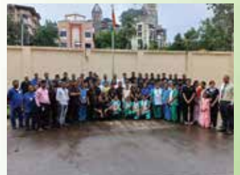
Fortis Hospital, Mulund