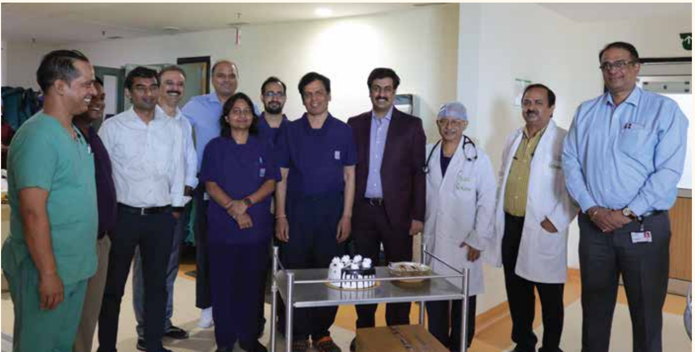
The team celebrating the success