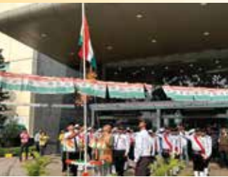
Fortis Hospital, Kolkata