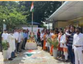
Fortis Nagarbhavi, Bengaluru