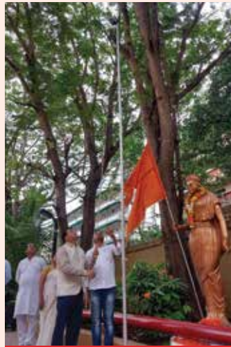
SL Raheja Hospital, Mahim