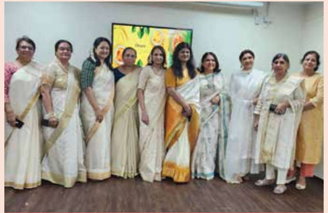
Fortis Hospital, LaFemme, GK II, New Delhi