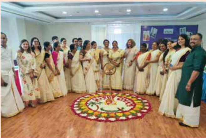
Fortis Escorts Hospital, Jaipur