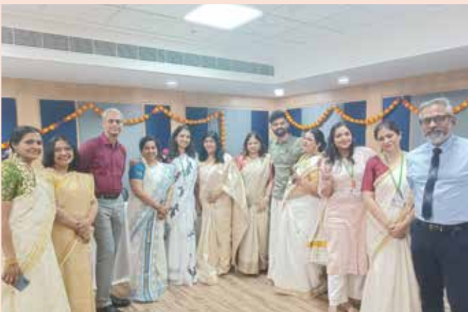
Fortis Hospital, Vashi