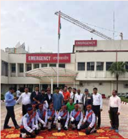
Fortis Escorts Hospital, Faridabad