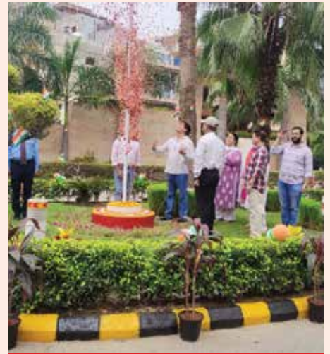
Fortis Hospital, Shalimar Bagh, New Delhi