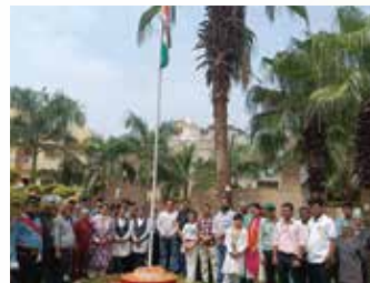
Fortis Hospital, Shalimar Bagh