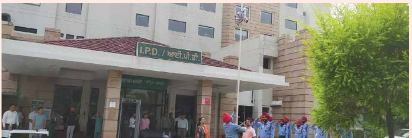
Fortis Escorts Hospital, Amritsar