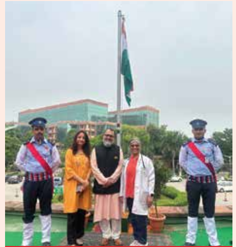
Fortis Hospital, Mohali