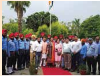
Fortis Escorts Hospital, Amritsar