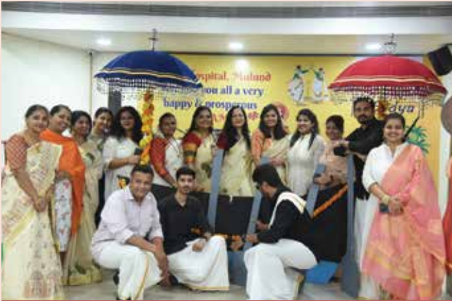
Fortis Hospital, Mulund