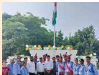
Fortis Hospital, Vasant Kunj