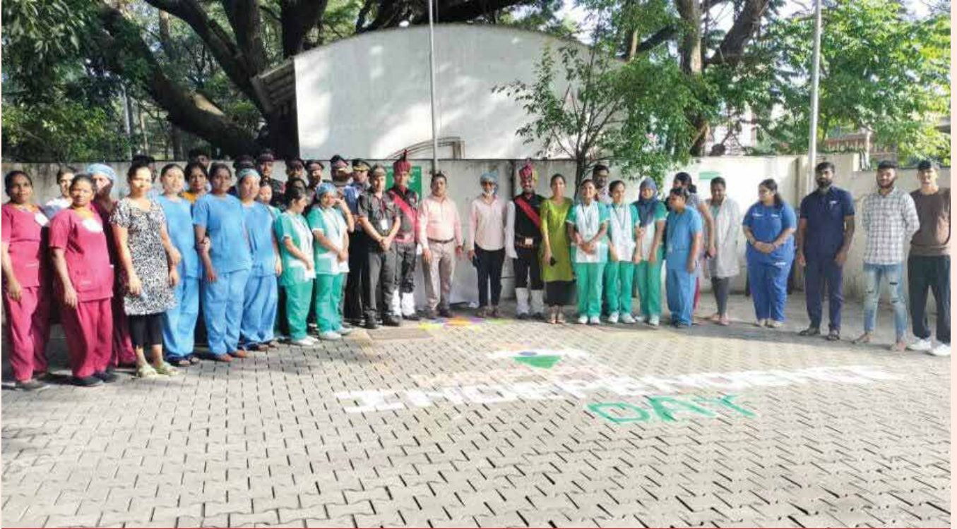
Fortis Hospital, Richmond Road, Bengaluru