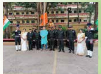
SL Raheja Hospital, Mahim