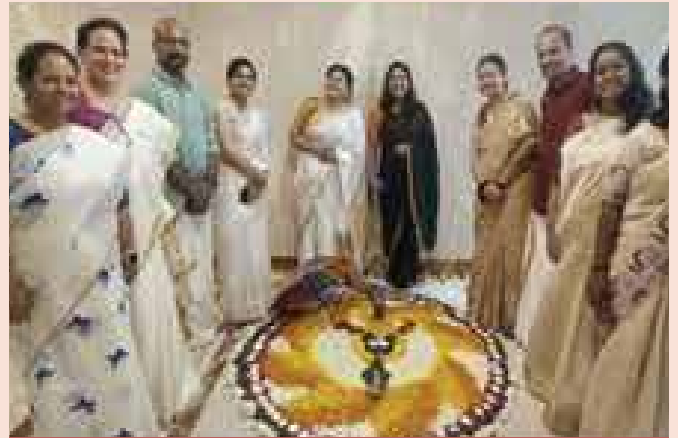
Fortis Corporate Office