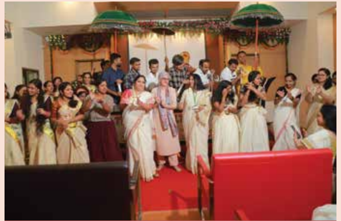
Fortis Escorts Heart Institute, Okhla, New Delhi