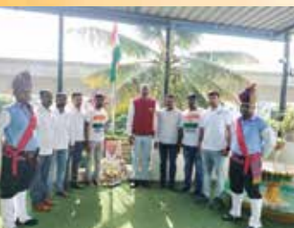
Fortis Rajajinagar, Bengaluru