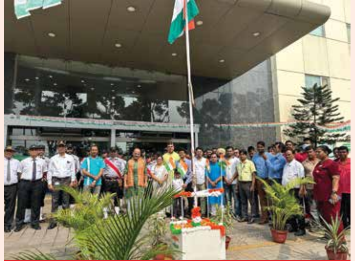
Fortis Hospital, Kolkata