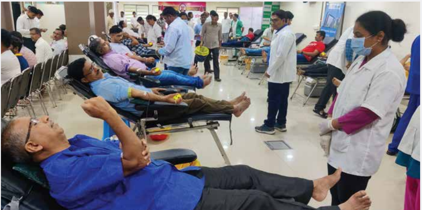
Blood donation drive is underway here