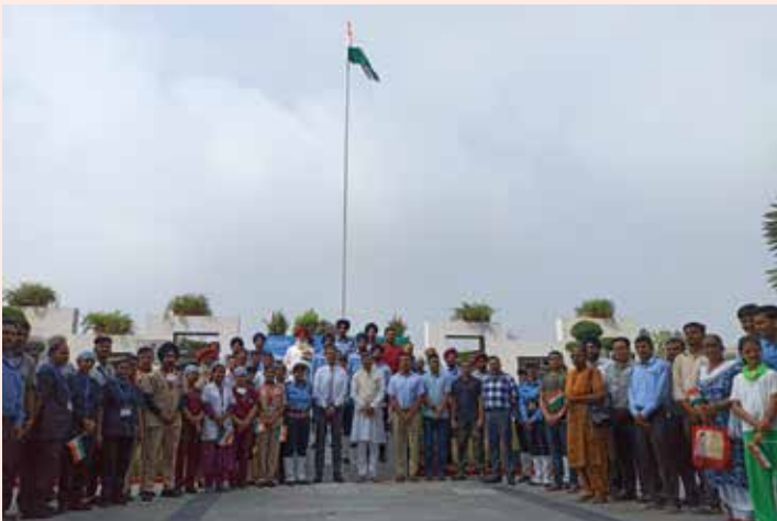
Fortis Hospital, Ludhiana