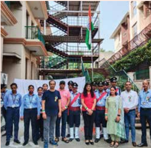
Fortis Hospital, La Femme, GK II, New Delhi