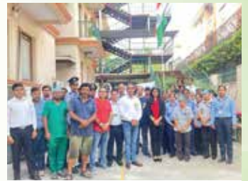
Fortis La Femme, GK II, New Delhi