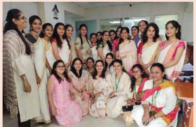
Fortis Hospital, Kalyan