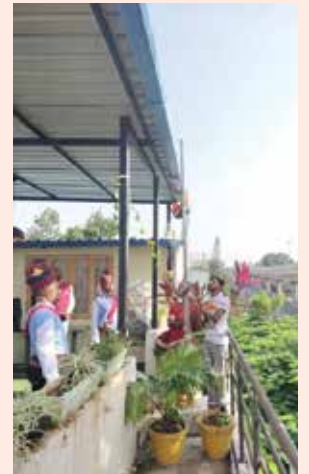
Fortis Rajajinagar, Bengaluru