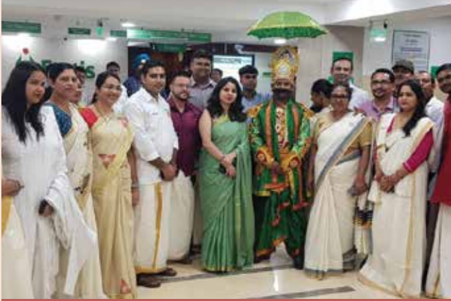
Fortis Vasant Kunj, New Delhi