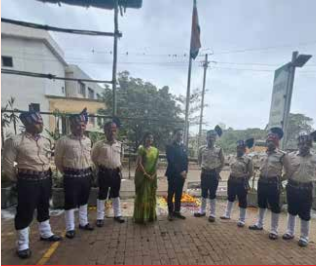
Fortis Hospital, Kalyan