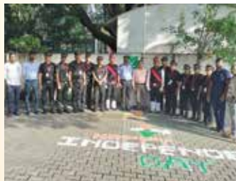
Fortis Hospital, Richmond Road, Bengaluru