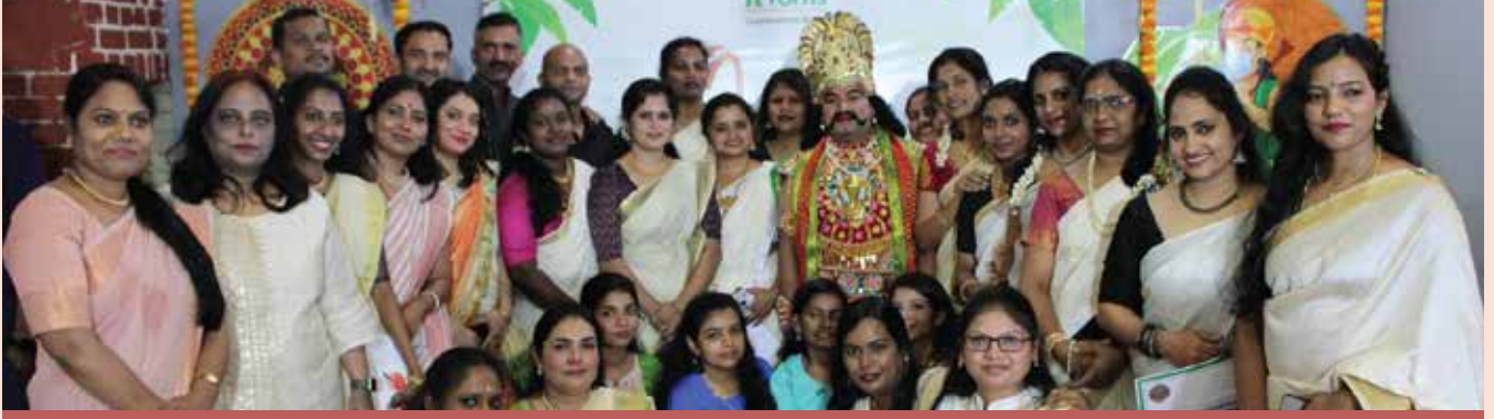
Fortis Hospital, Cunningham Road, Bengaluru