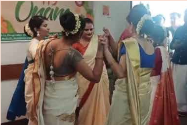
Fortis Hospital, C-DOC, New Delhi