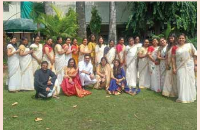
Fortis Escorts Hospital, Faridabad