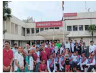
Fortis Escorts Hospital, Faridabad