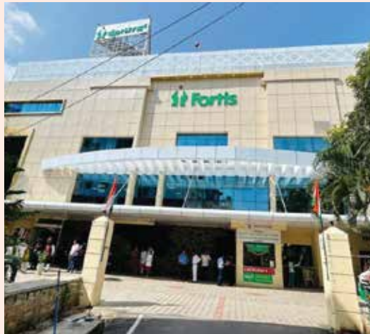
Fortis Nagarbhavi, Bengaluru