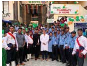
Fortis Hospital, CG Road, Bengaluru