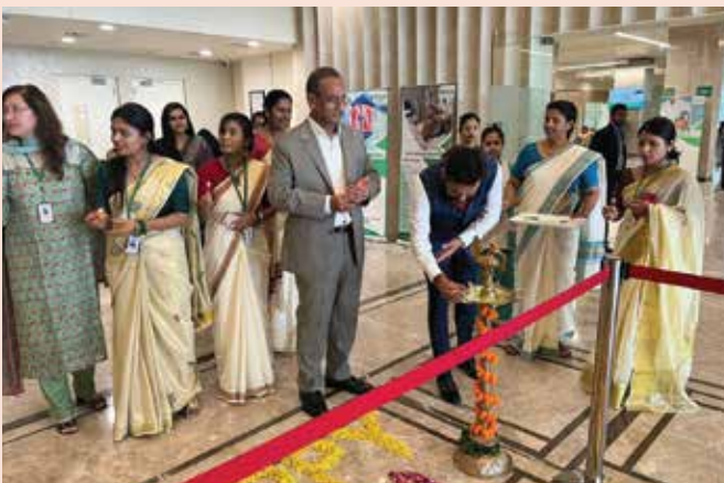
Fortis Hospital, Greater Noida