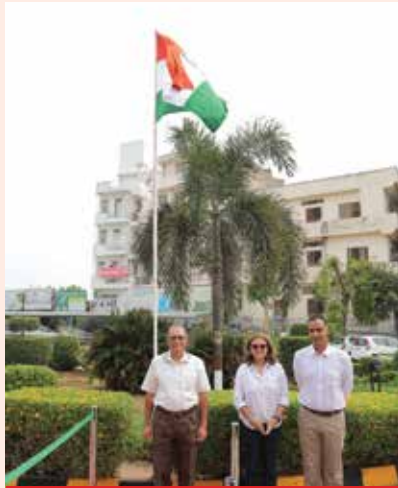
Fortis Escorts Hospital, Jaipur