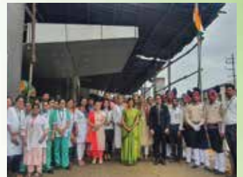
Fortis Hospital, Kalyan