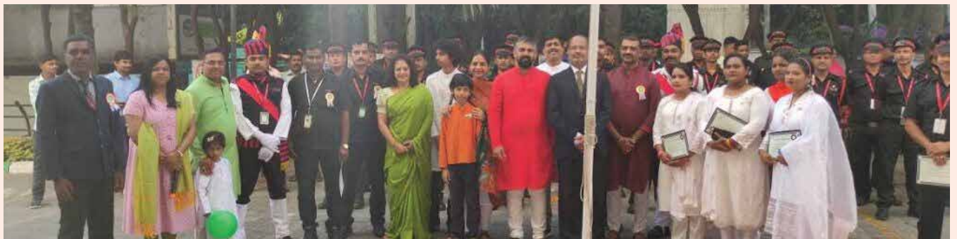
Fortis Hospital, Bannerghatta Road, Bengaluru