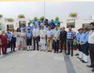
Fortis Hospital, Ludhiana