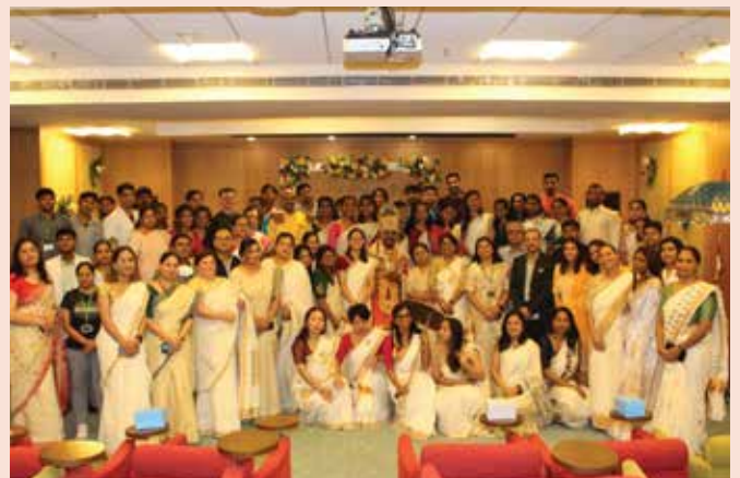
Fortis Memorial Research Institute, Gurugram