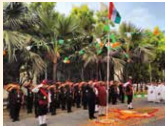
Fortis Hospital, BG Road, Bengaluru