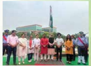
Fortis Hospital, Mohali