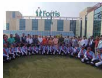
Fortis Memorial, Gurugram