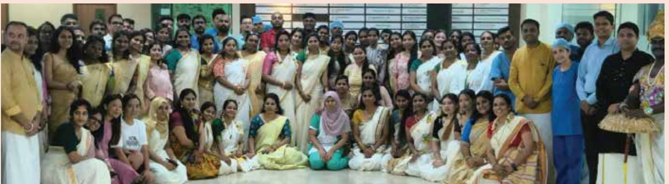
Fortis Hospital, Richmond Road, Bengaluru