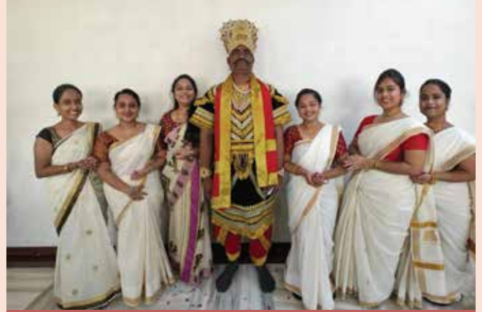
SL Raheja, Mahim