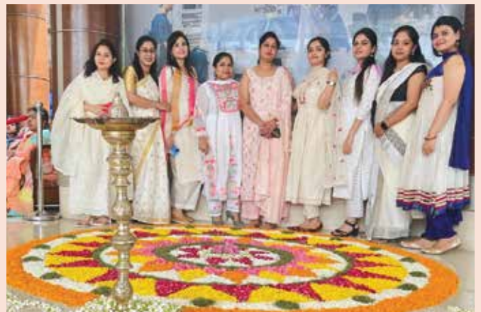
Fortis Hospital, Shalimar Bagh, New Delhi