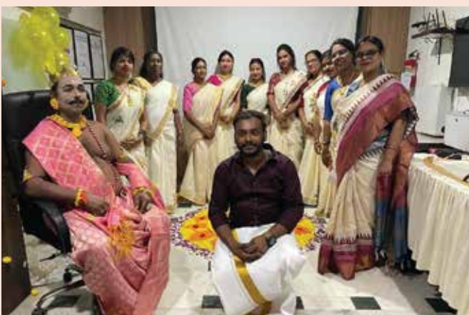
Fortis Heart & Kidney Institute, Kolkata