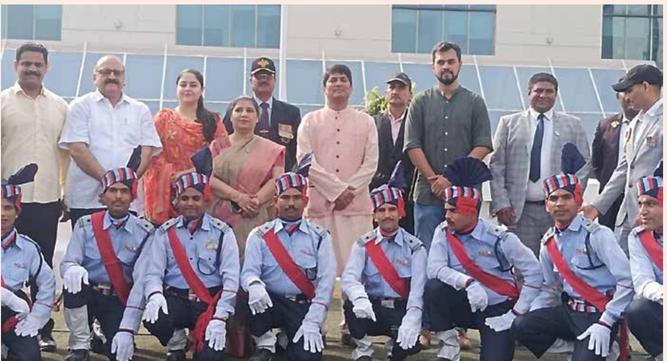
Fortis Memorial Research Institute , Gurugram