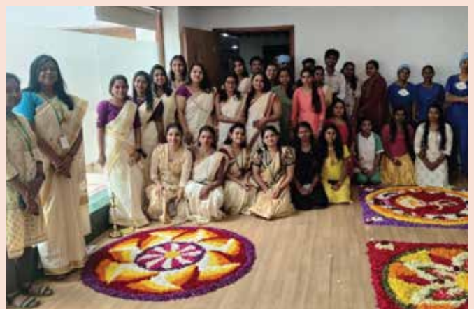
Fortis Hospital, BG Road, Bengaluru