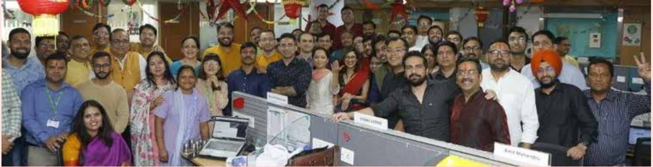
Fortis Corporate Office