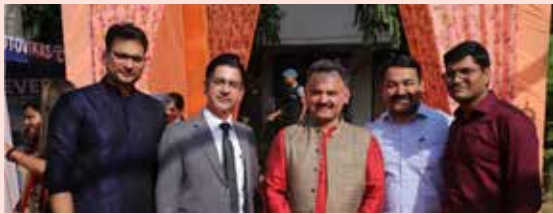
Fortis Escorts, Faridabad