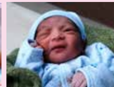
Baby of Abdullah - Fortis C-DOC