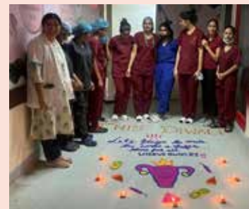
Fortis Hospital, Mohali