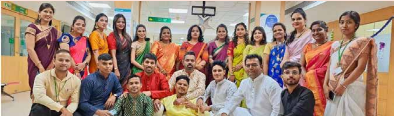
Hiranandani Hospital, Vashi