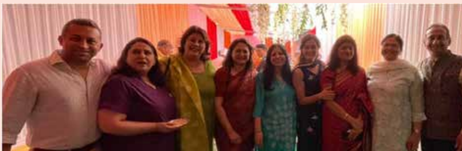
Fortis La-Famme, GK- II, New Delhi