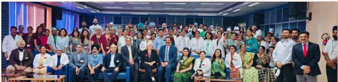
The JCI surveyor team with the Fortis Mohali management and healthcare officials.