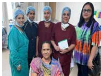
Name & Department of the Fortisian: CTVS Nursing Staff