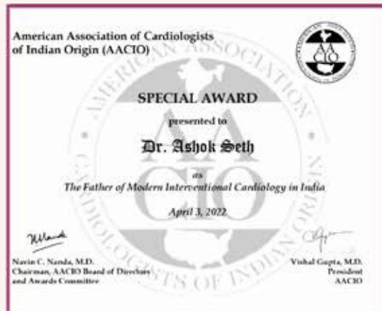
Felicitation from American Association of Cardiologists of Indian Origin