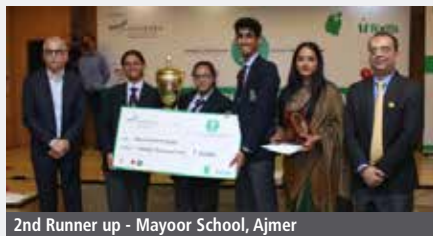
2nd Runner up - Mayoor School, Ajmer