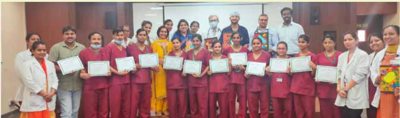
Participants of Critical Care Certified Course