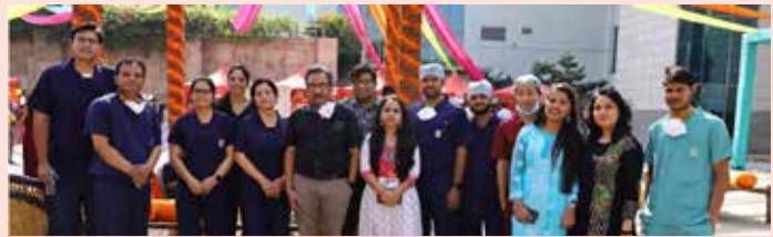
Fortis Memorial Research Institute, Gurugram