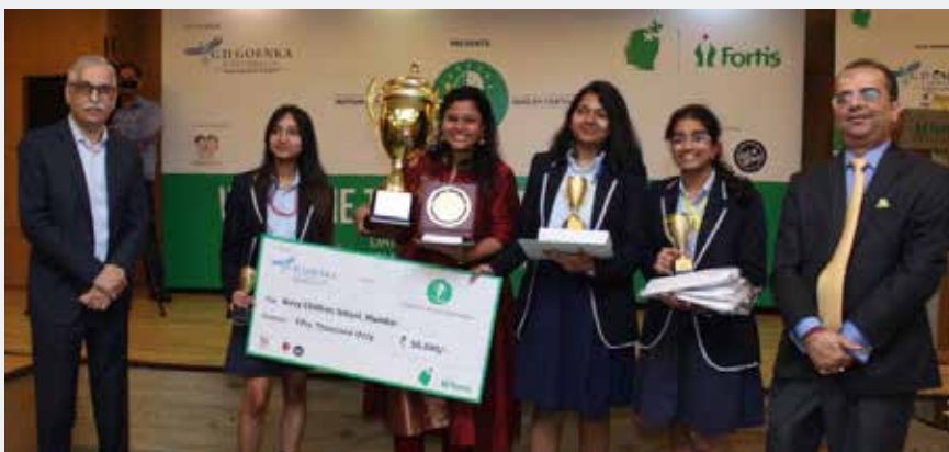
Winners - Navy Children School, Mumbai