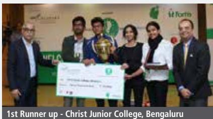
1st Runner up - Christ Junior College, Bengaluru