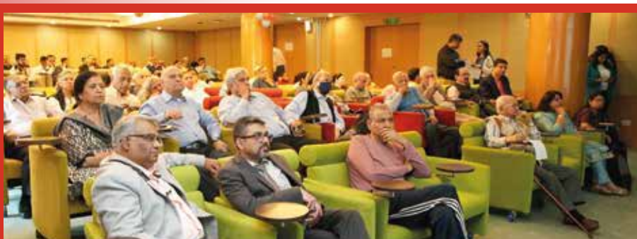
Fortis Memorial Research Institute, Gurugram