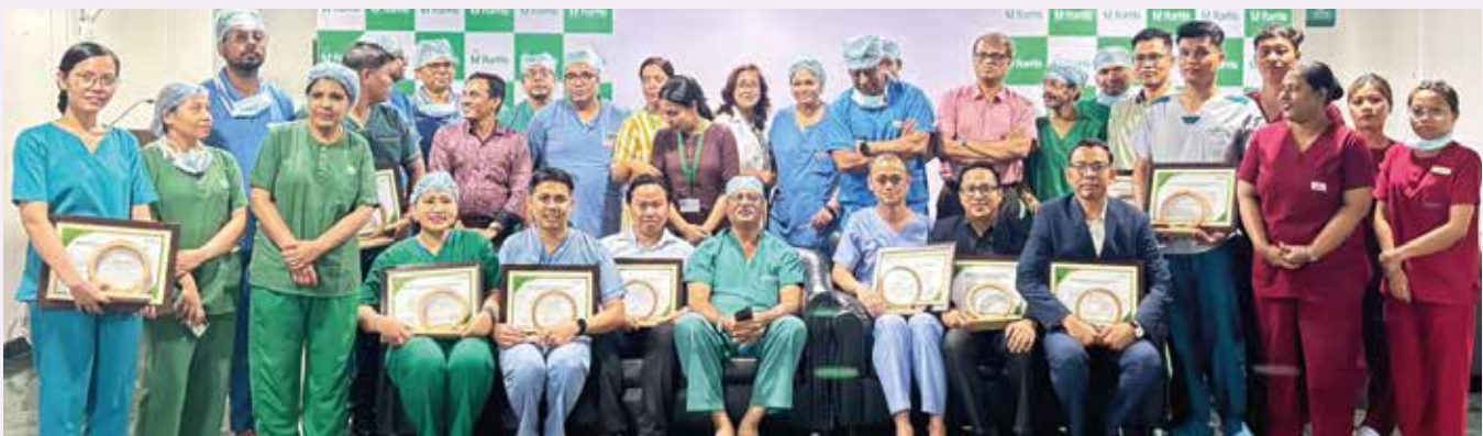
Group Photo with the CTVS Department