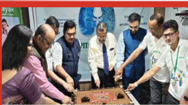
Fortis Hospital & Kidney Institute, Kolkata