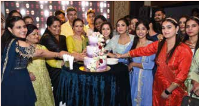
Fortis Hospital, Ludhiana