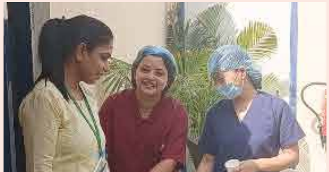
Fortis Hospital, CDCC