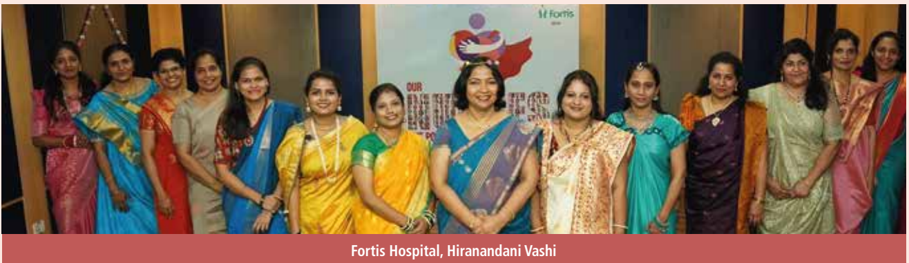
Fortis Hospital, Hiranandani Vashi