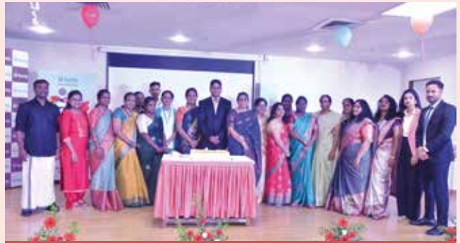
Fortis Hospital, BG Road, Bangalore