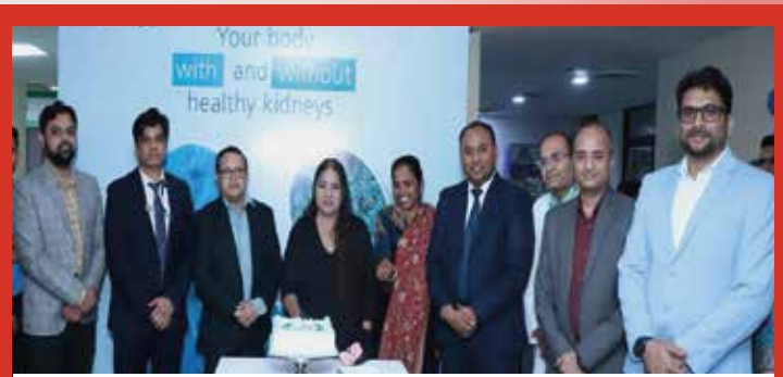
Fortis Escorts Hospital, Faridabad