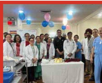
Fortis Hospital, Amritsar