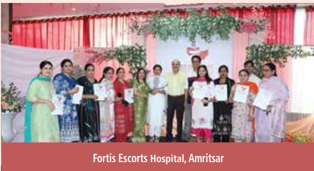
Fortis Escorts Hospital, Amritsar