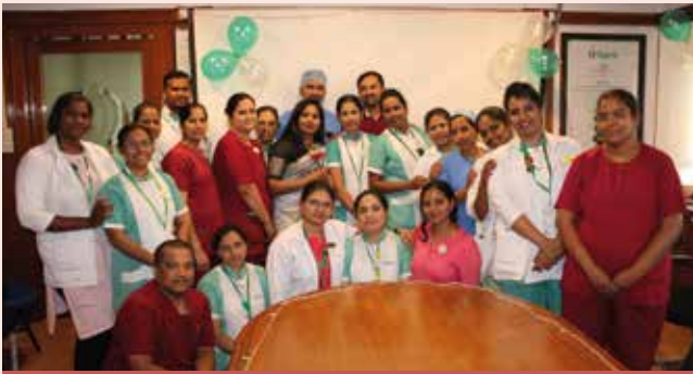
Fortis Hospital, CG Road, Bangalore