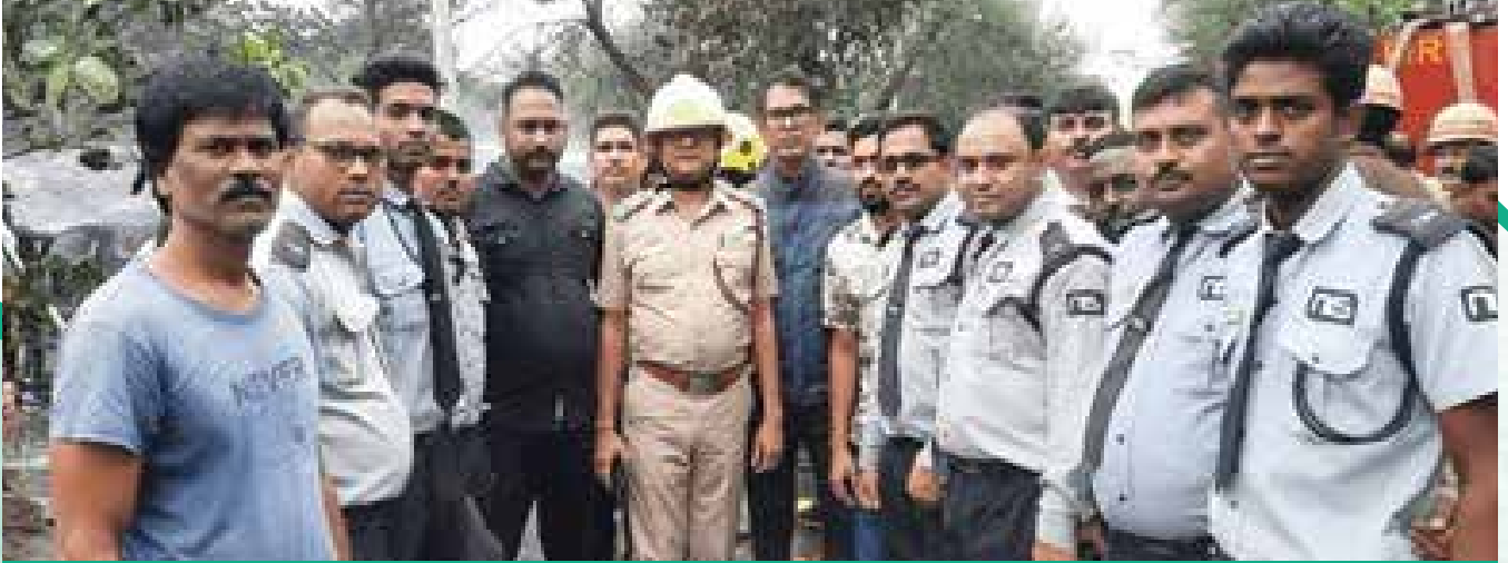
Security Team with the Fire Department