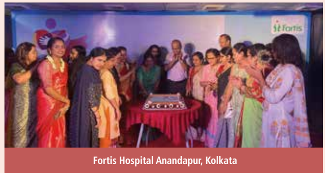
Fortis Hospital Anandapur, Kolkata