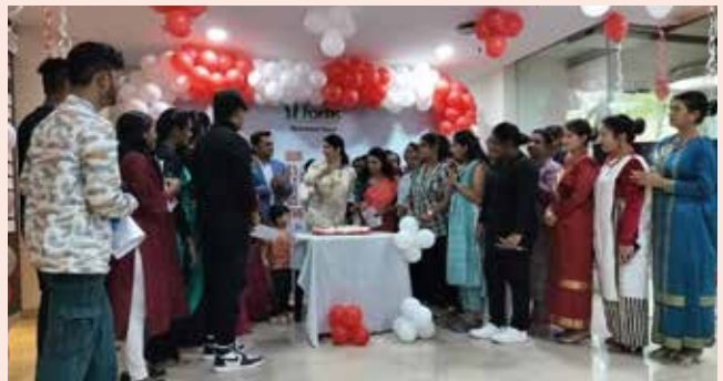
Fortis Hospital, Richmond Road, Bangalore