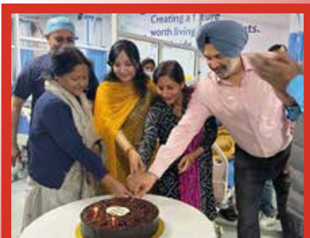
Fortis Hospital, Noida