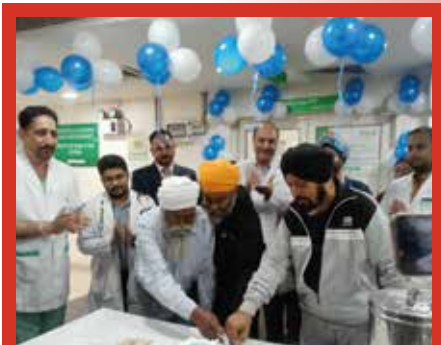
Fortis Hospital, Ludhiana