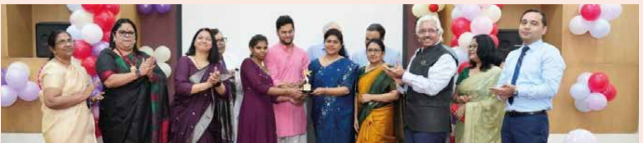
Fortis Escorts Heart Institute, Okhla