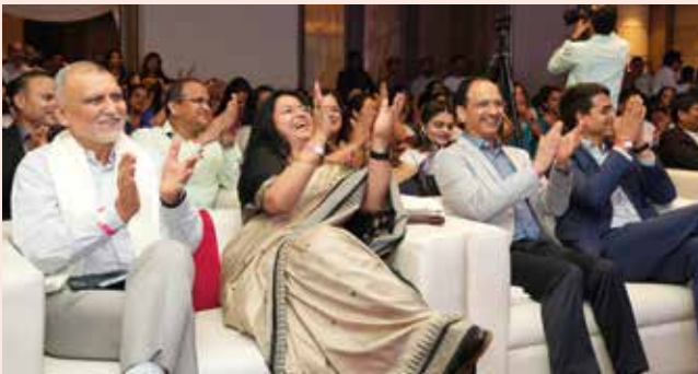
Fortis Memorial Research Institute, Gurugram