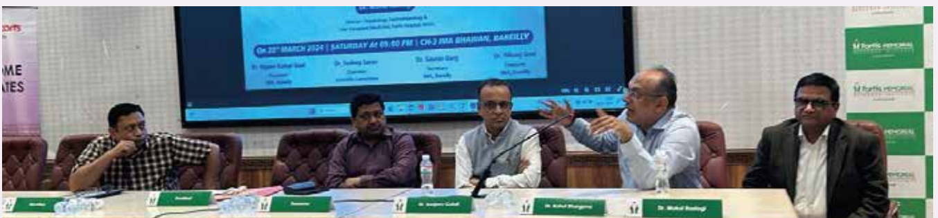
Interaction with IMA Clinicians

As part of its Upcountry Outreach Strategy, the Fortis Corporate Sales Team organised the first 'One Fortis CME' in Bareilly with association of IMA Bareilly on March 30, 2024, at IMA Bhawan.