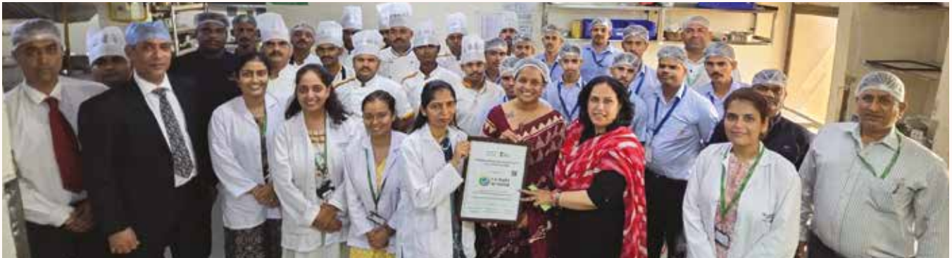
Team F&B, Dieticians and Administrators holding up the Eat Right certification