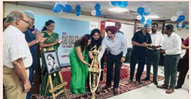
Fortis Hospital, Noida