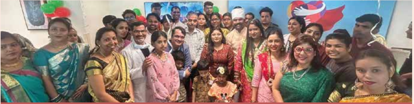
Fortis Hospital, Greater Noida