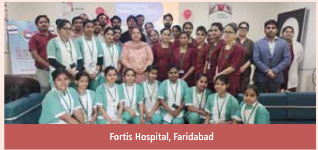
Fortis Hospital, Faridabad