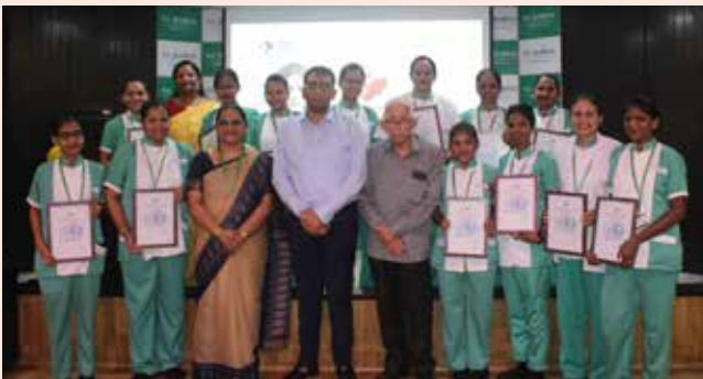
Fortis Hospital, SL Raheja