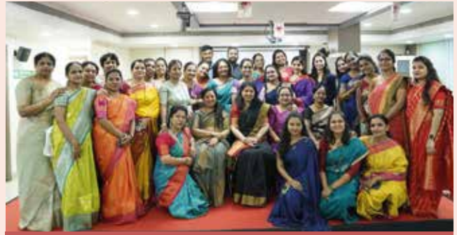
Fortis Hospital, Mulund