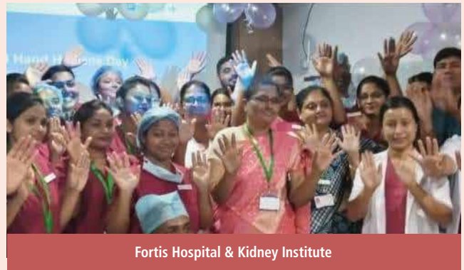
Fortis Hospital & Kidney Institute