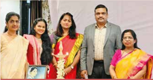
Fortis Hospital, Kalyan