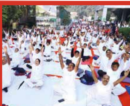
Fortis Hospital, Vasant Kunj