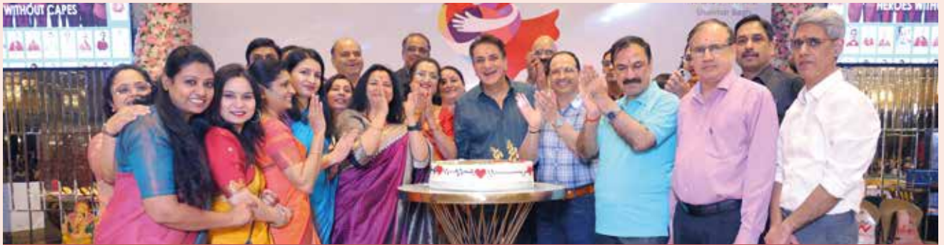
Fortis Hospital, Shalimar Bagh