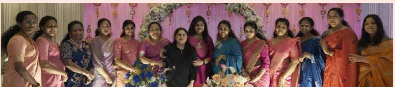
Fortis Hospital, La Femme GK II