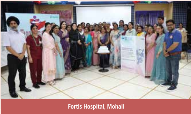
Fortis Hospital, Mohali