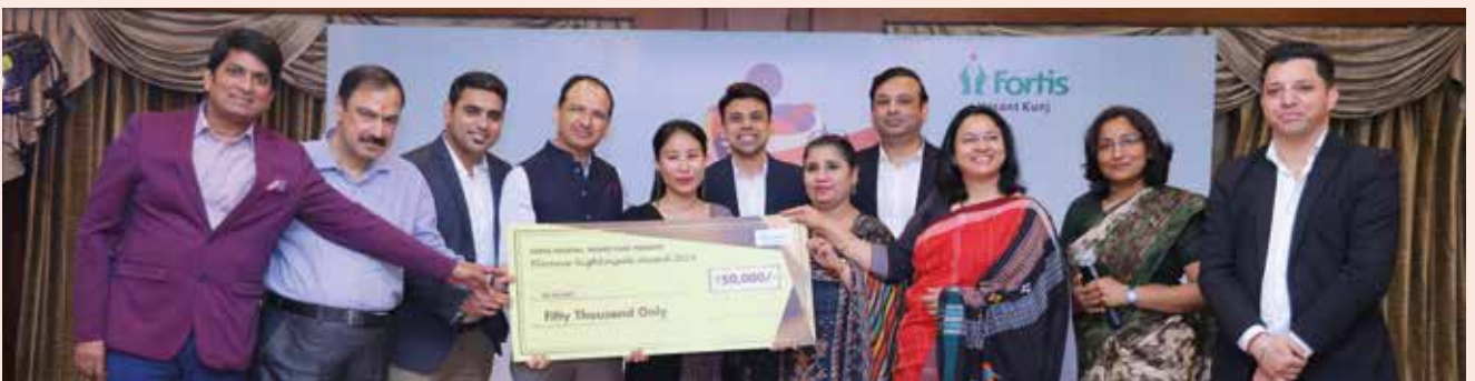
Fortis Hospital, Vasant Kunj