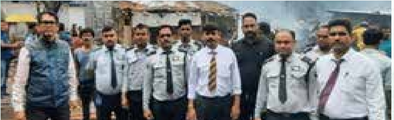
Security Team and staff from Fortis Hospital, Anandapur