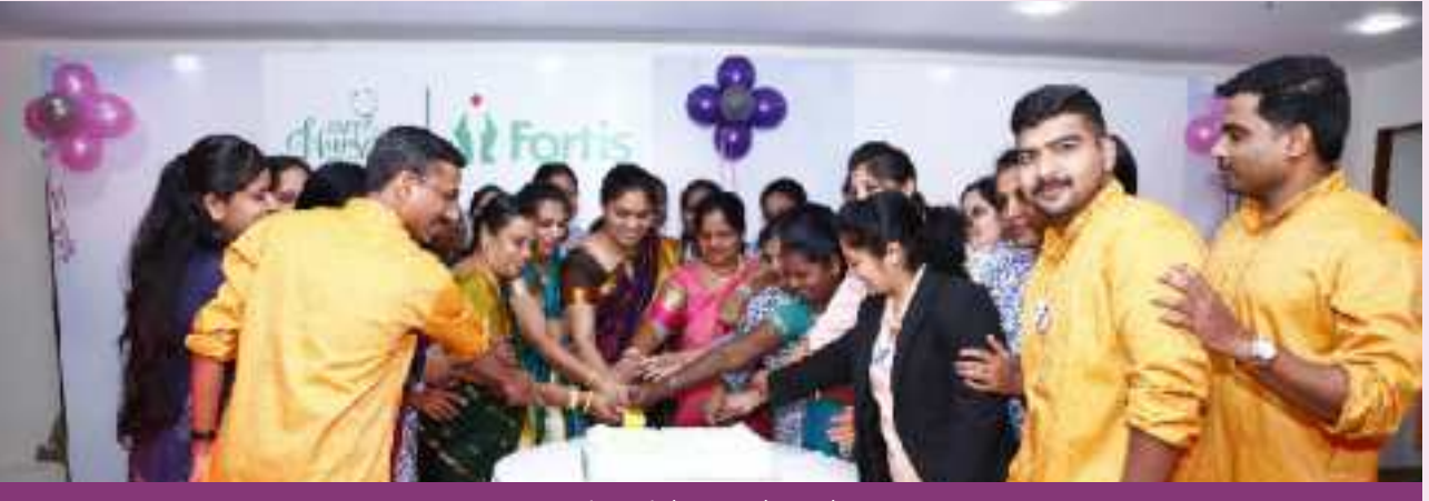
Fortis Hospital, B.G. Road, Bengaluru