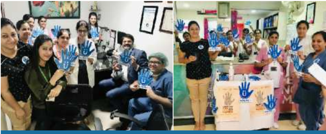
Fortis La Femme, Greater Kailash-II, New Delhi