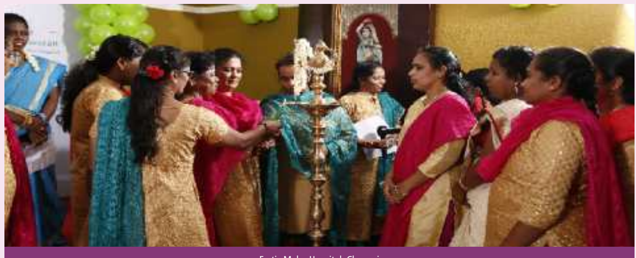
Fortis Malar Hospital, Chennai