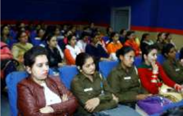
Delhi Police women officers at the event