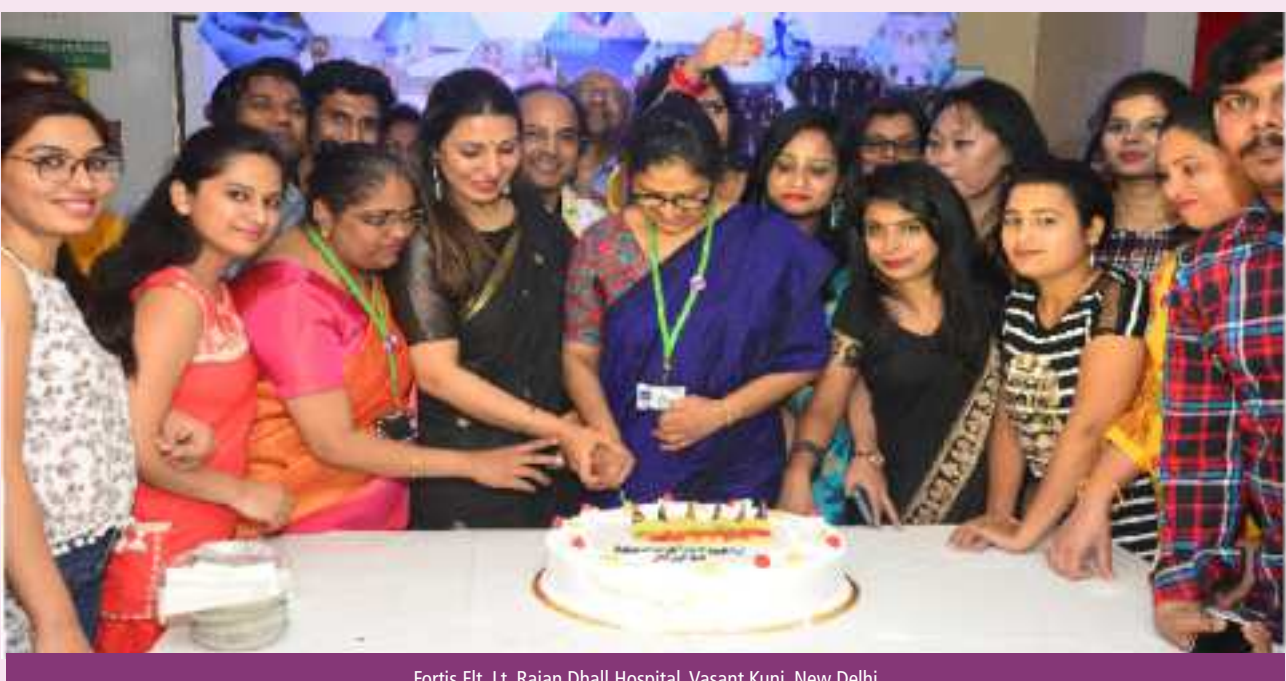
Fortis Flt. Lt. Rajan Dhall Hospital, Vasant Kunj, New Delhi