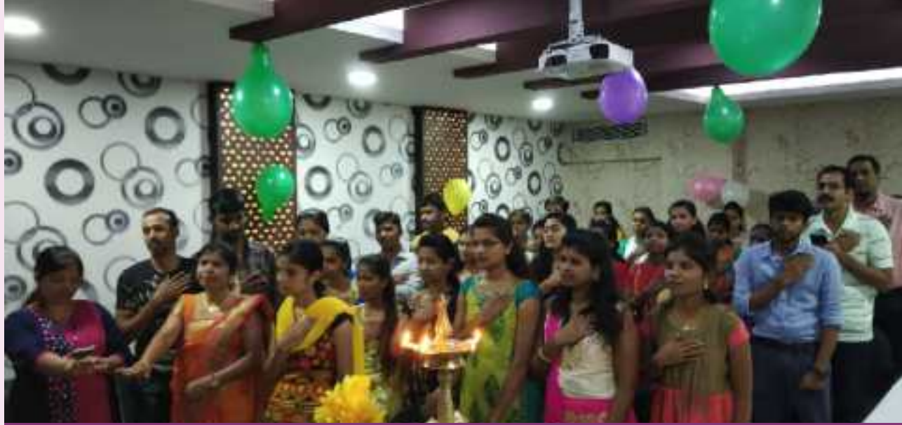
Fortis Hospital, Nagarbhavi, Bengaluru