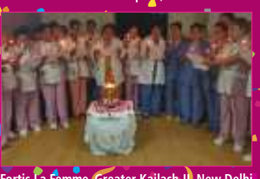
Fortis La Femme, Greater Kailash-II, New Delhi