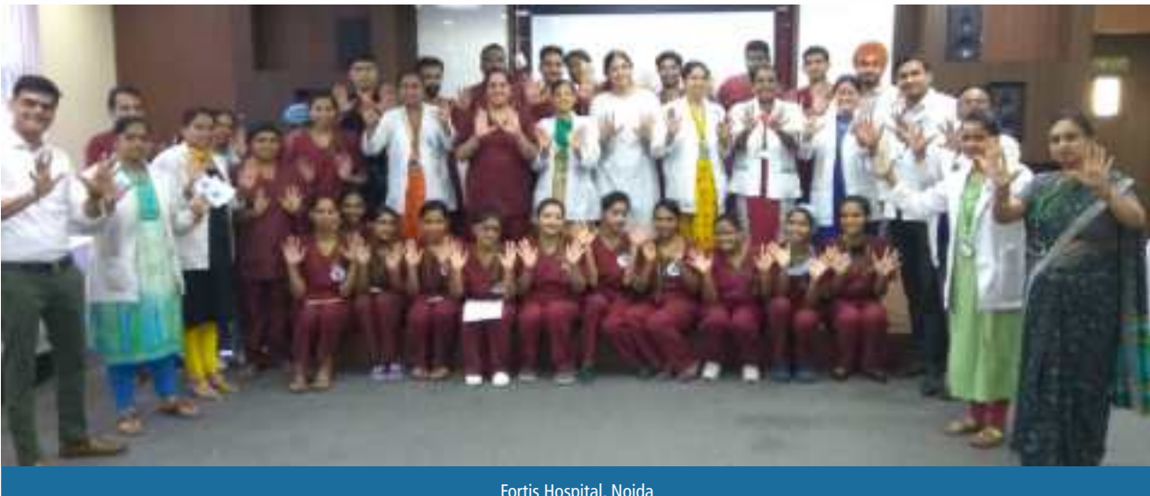
Fortis Hospital, Noida