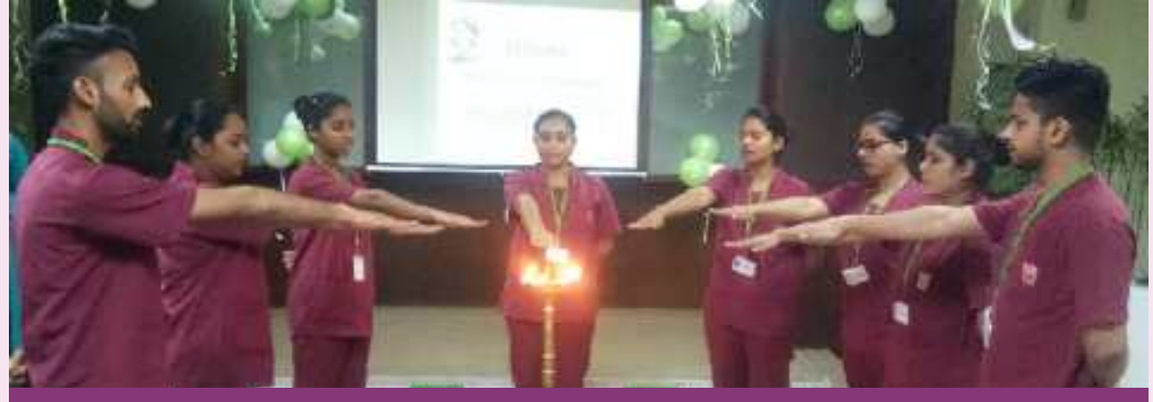
Fortis Hospital, Ludhiana