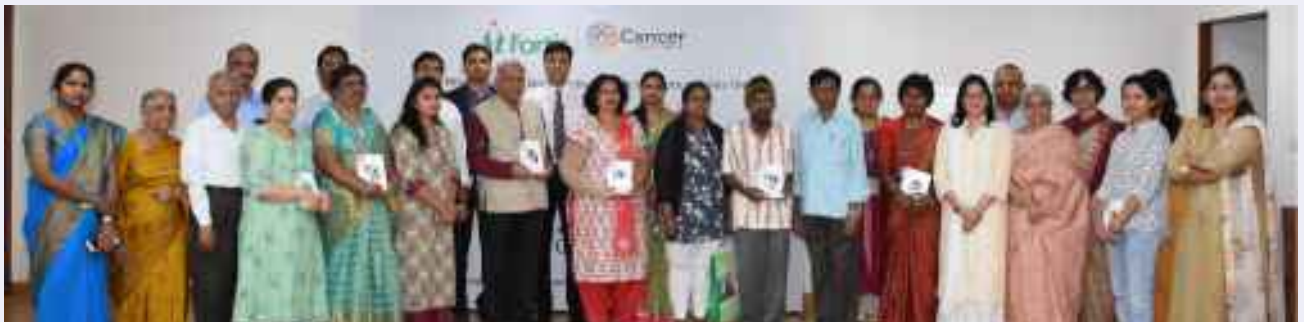
The team of doctors at Fortis Cancer Institute felicitating the care givers and the cancer survivors during the interactive session held on the account of Women