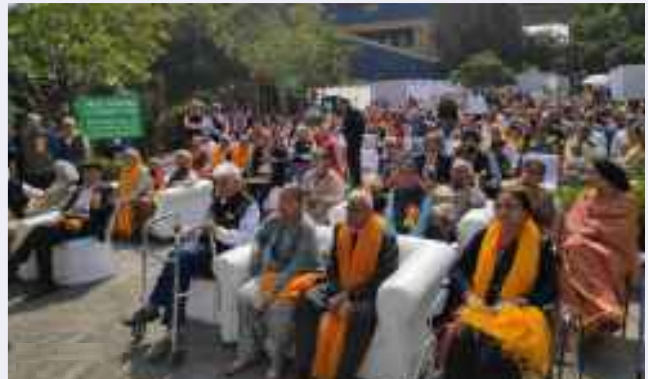
More than 400 senior citizens from 20 nearby RWAs participated in the event