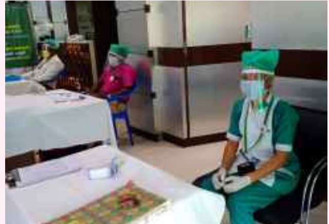
Fortis Malar Hospital, Chennai