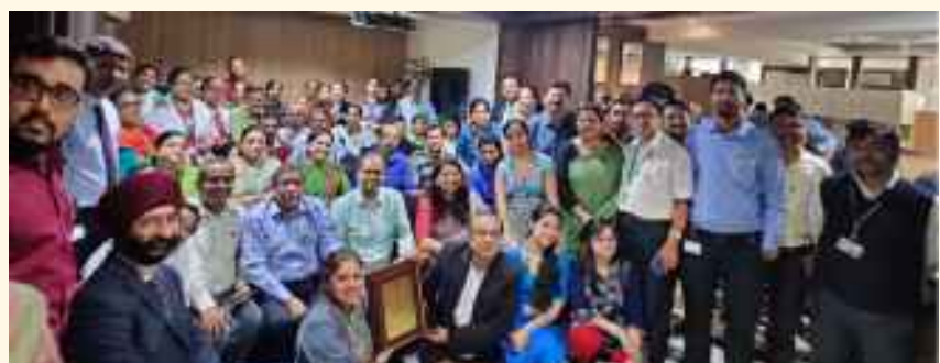
Team FHKI celebrating the win