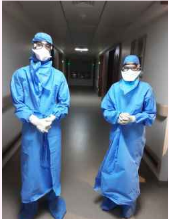
SL Raheja Hospital, Mahim-A Fortis Associate