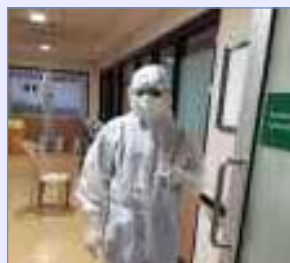
Fortis Hospital, Shalimar Bagh, New Delhi