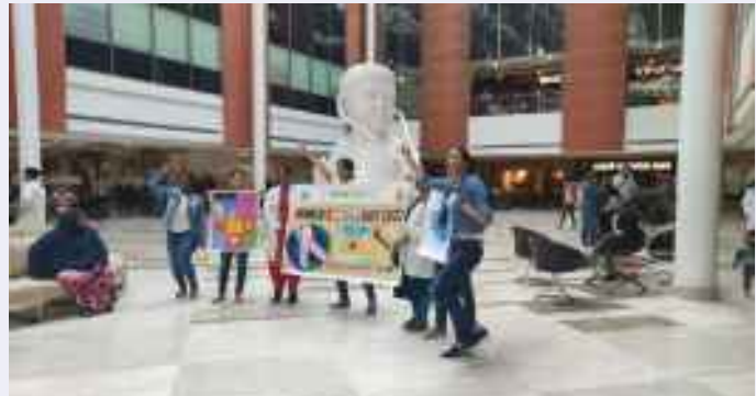
Flash mob group dance