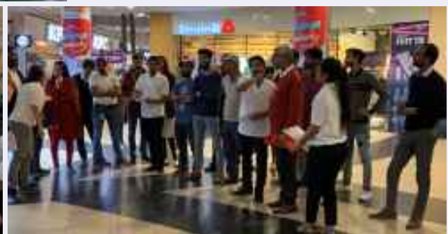
Glimpses of the activity