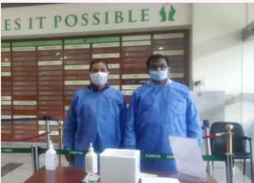
Fortis Hospital, B.G. Road, Bengaluru