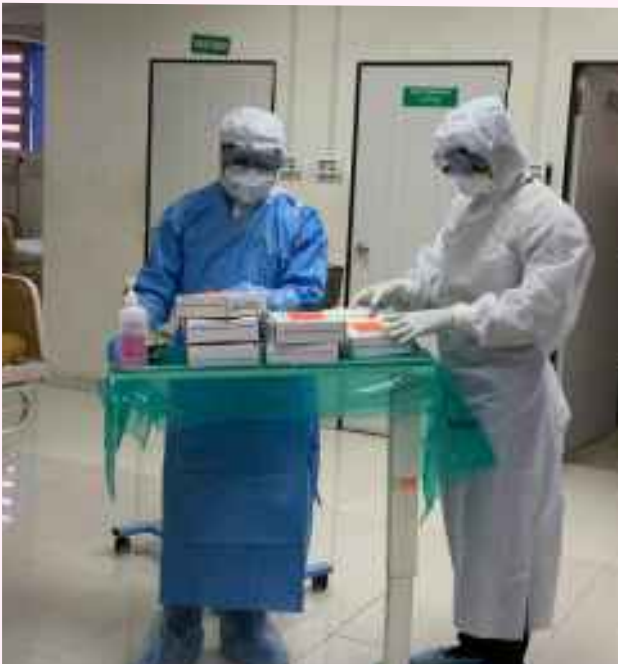
Fortis Hospital, Kalyan