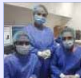
Fortis Hospital, B.G. Road, Bengaluru