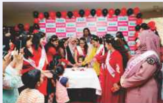
The participants cutting the cake to celebrate their journey to motherhood