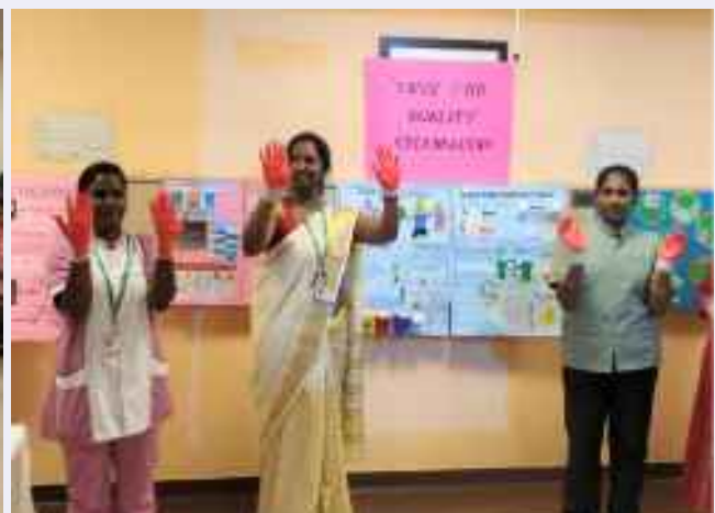
Volunteers performing hand hygiene 'glove paint' activity