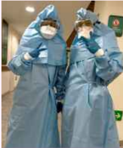
Fortis Hospital, Anandapur