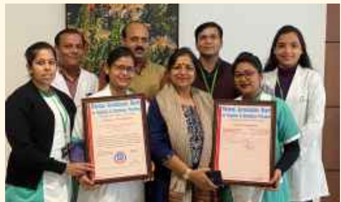
Team Blood Bank with the NABH accreditation certificates