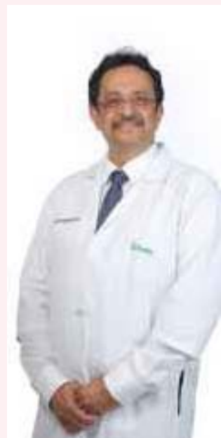
Dr Mohan Keshavamurthy

Currently, high grade bladder cancer in India is treated with BCG intravesical immunotherapy. However, a large proportion of patients experience a recurrence. If BCG becomes unresponsive, then a cystectomy (removal of the bladder) has to be performed. Some patients may not be considered for this option due to side effects. Approximately 50% of patients with bladder cancer develop recurrence after BCG therapy. HIVEC helps in bladder preservation strategy for such patients.