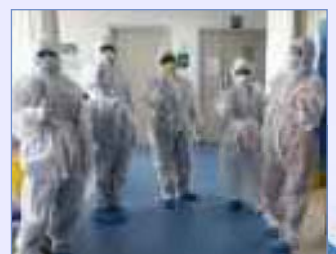
Fortis Hospital, Anandapur