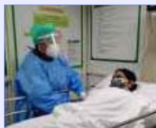
Fortis Malar Hospital, Chennai