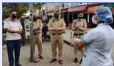
Fortis Hospital, Ludhiana