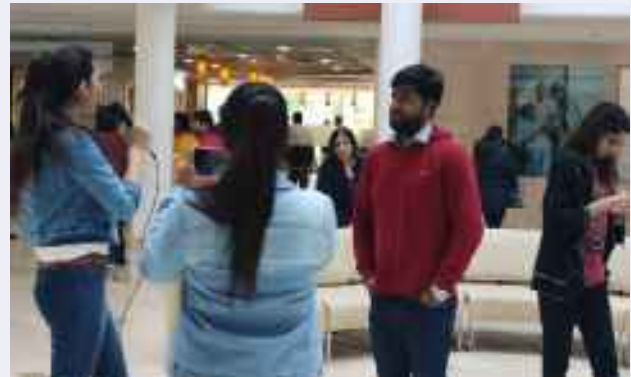
Interactive session with the visitors

On the occasion of World Cancer Day, the Department of Nursing, Fortis Memorial Research Institute (FMRI), Gurugram, conducted a campaign to build awareness about cancer and its prevention. The day began with the distribution of pink ribbons to FMRI family members to create awareness among them. A 'Flash Mob Group Dance' was performed and educational pamphlets on the theme 'I am – I will' were distributed among the patients and visitors at the hospital. The campaign ended with an interaction with the visitors, patients and their attendants on cancer, its causes, warning signs and preventive measures. Patients and their attendants participated in the interactive session with zeal and enthusiasm.