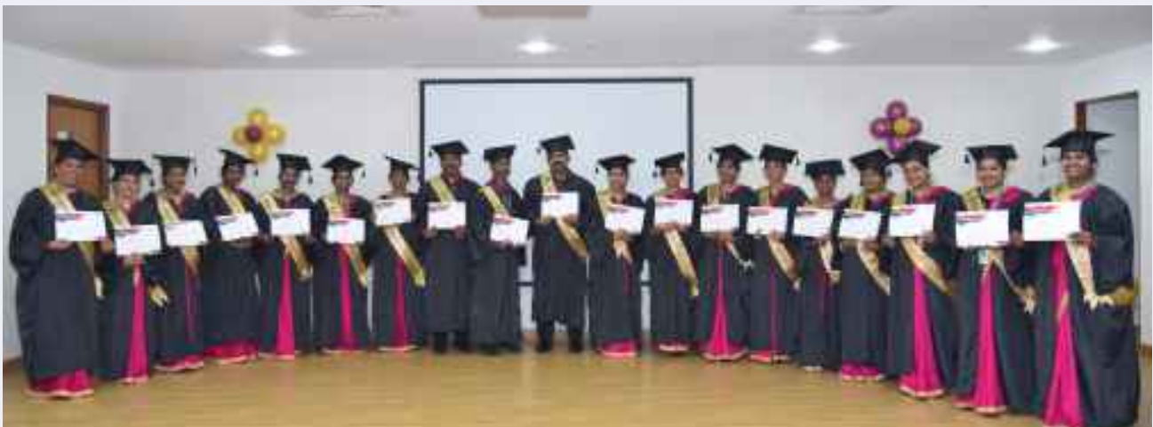
The new Nurse Leaders at the graduation ceremony