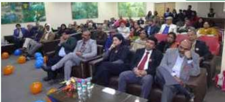
Patients and family members at the event