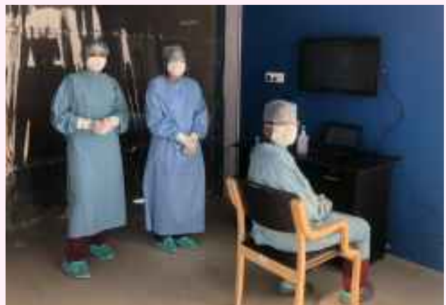
Fortis Hospital, Ludhiana