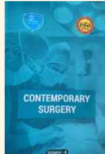
The cover of the book