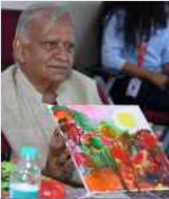
Cancer survivor displaying his painting during the art therapy

their caregivers improve their mental wellbeing, an art therapy workshop was conducted on the theme of 'Family Against Cancer.' Two cancer survivors delivered motivational speeches to encourage the patients and their attendees who are currently undergoing cancer treatment. As part of the event, a support group was also launched for the cancer patients that would provide integrated sessions for patients and their attendants on yoga, nutrition and counselling.