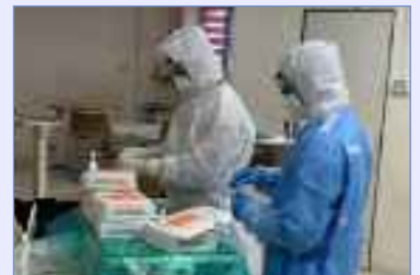
Fortis Hospital, Kalyan