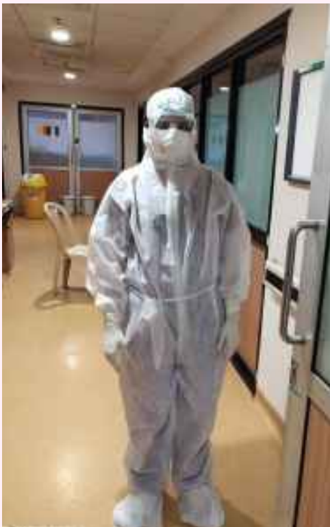
Fortis Hospital, Shalimar Bagh, New Delhi