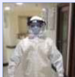
Fortis Escorts Hospital, Faridabad