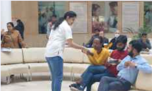
Nursing team distributing educational flyers