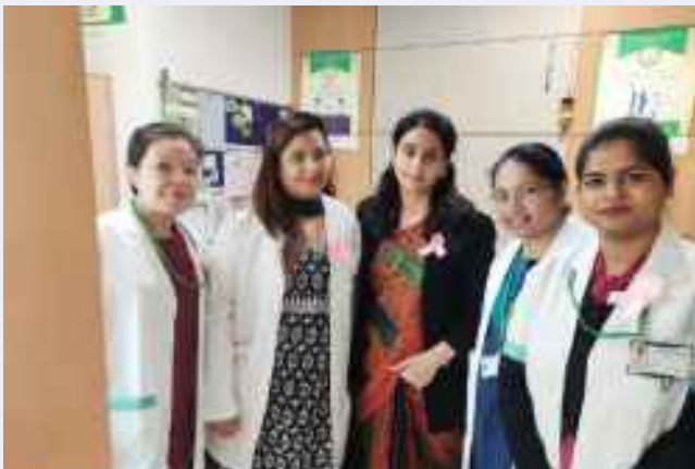
FMRI family wearing pink ribbons to raise awareness on cancer