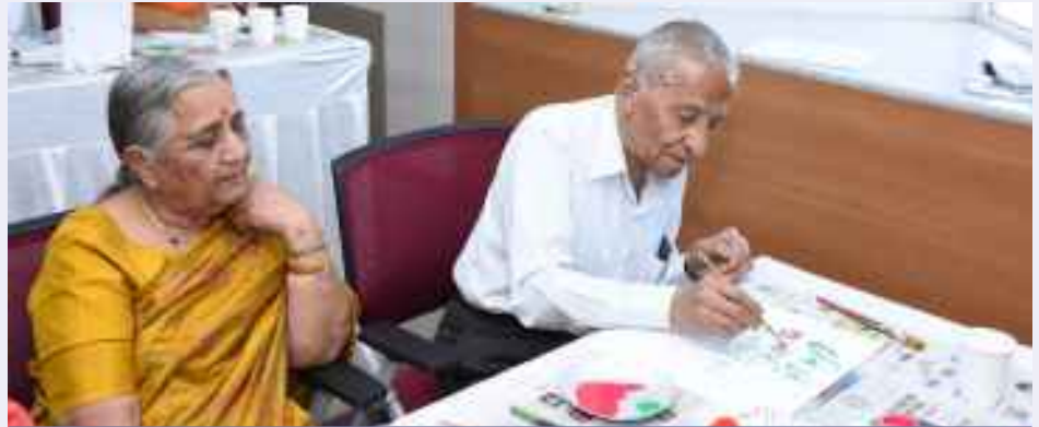
The cancer survivors and their caregivers painting their imaginations on the canvas during the art therapy conducted by Fortis Cancer Institute, Bangalore