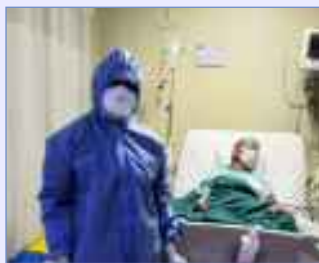
Fortis Escorts Hospital, Okhla Road, New Delhi