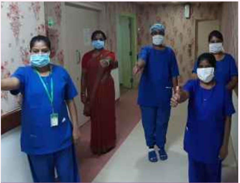
Fortis Hospital, Rajajinagar, Bengaluru