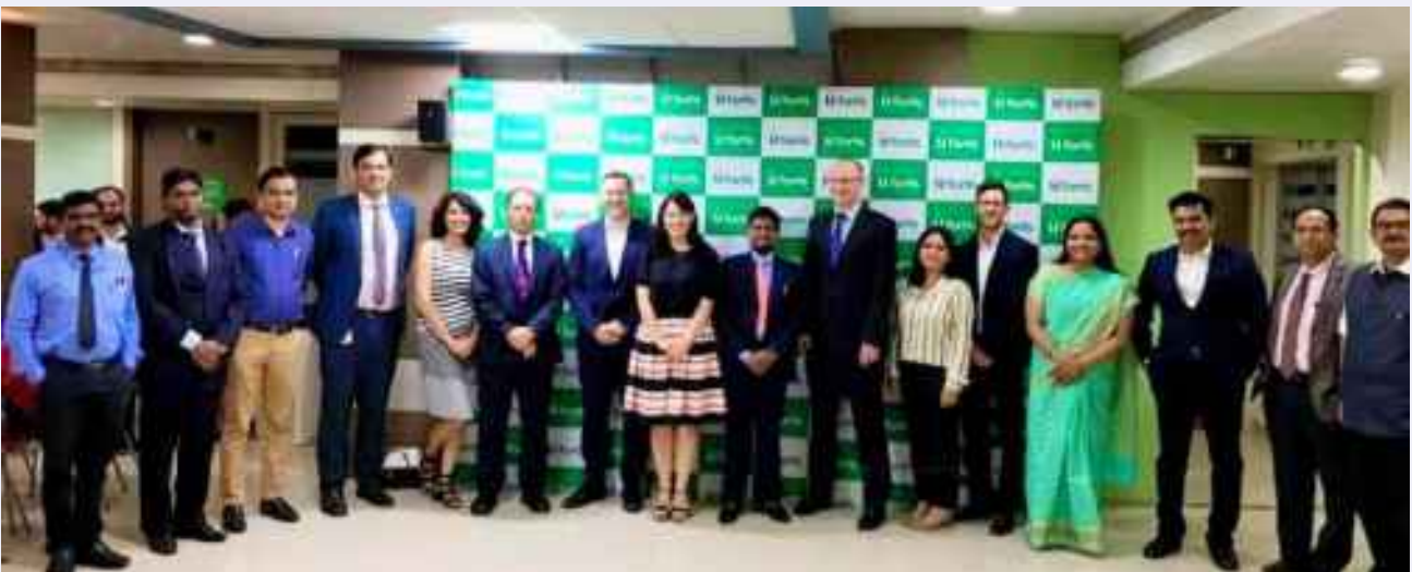
Emergency Medicine experts from Fortis Hospital, Mulund & SL Raheja Hospital, Mahim are joined by the team from Mid Yorkshire NHS Trust Hospitals & the participants