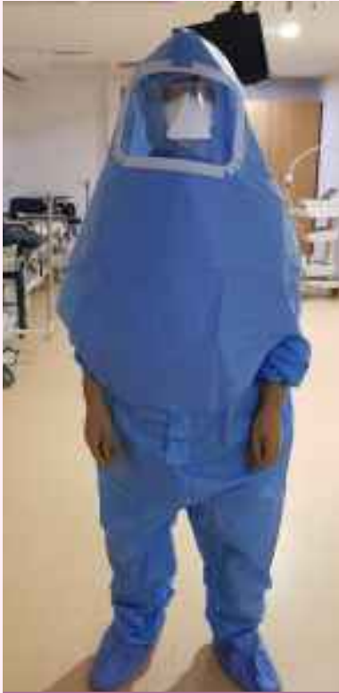
Fortis Memorial Research Institute, Gurugram