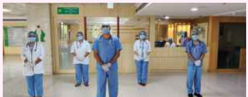
Hiranandani Hospital, Vashi (A Fortis Network Hospital)