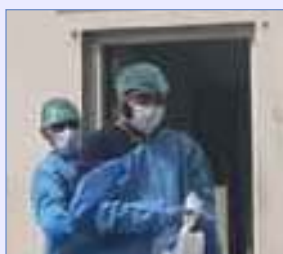
Fortis Escorts Hospital, Jaipur