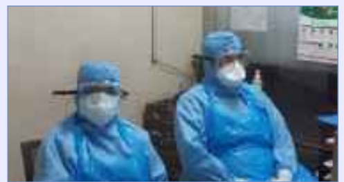
Fortis Hospital, Noida