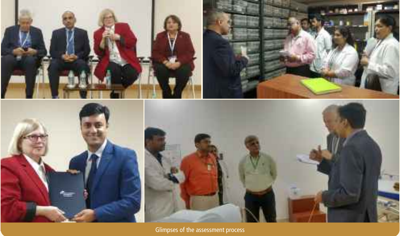
Glimpses of the assessment process

accreditation. Our hospital's patient care standards are at par with International standards and we are proud of the team of expert clinicians and the staff and salute their leadership in their respective areas. We are perhaps the only hospital in the city to be accredited 5 times by JCI."