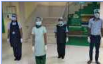
Hiranandani Hospital, Vashi (A Fortis Network Hospital)