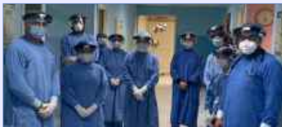
Fortis Hospital, Mohali