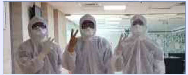
Fortis Memorial Research Institute, Gurugram