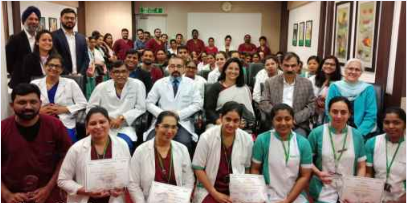
Nursing staff members with their trophies along with senior clinicians and leaders

As per earlier guidelines, a cannula had to be changed within 72 hours but now there is no time limit and a cannula can be used till it is safe to do so. Close to 320 nurses were trained and audited as part of the project. Based on the audit results, the staff nurses and teams were recognised under various categories such as Best Flushing Practice (Clear Lines), Maximum Smart Site Clave Connector (Closed Lines), Best Hand Hygiene, Best Cannulation and Best Unit. The project was applauded and awarded at the 'Nurse Leaders' Meet held in Delhi recently.