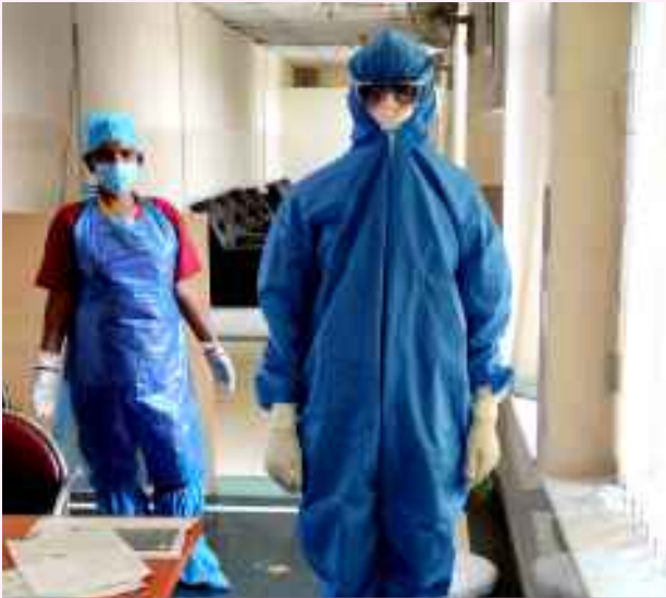
Fortis Hospital, Noida