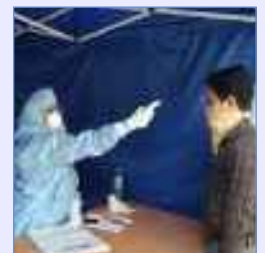
Fortis Hospital, C.G. Road, Bengaluru