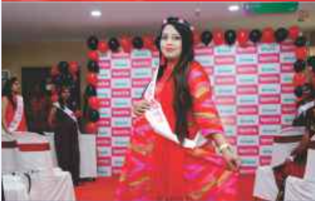
Participants walking the ramp during the baby shower event