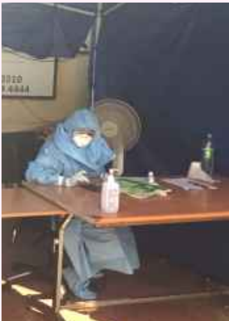
Fortis Hospital, CG Road, Bengaluru