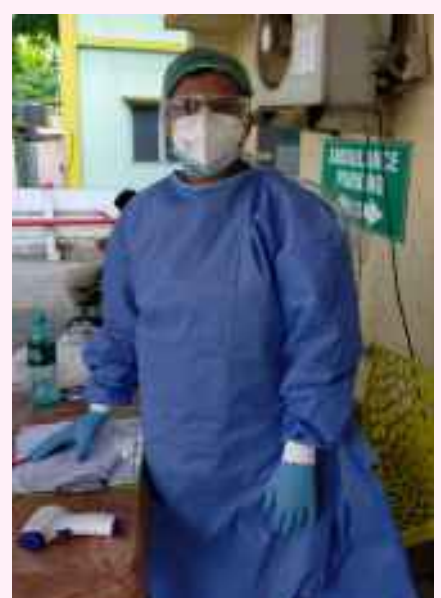
Fortis Hospital, Nagarbhavi, Bengaluru