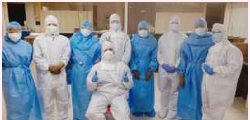
Fortis Hospital, Mulund