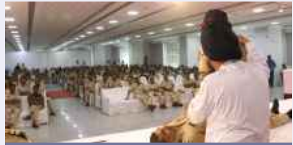
Police officers attending the training on Cardio-Pulmonary Resuscitation during the health check-up camp organized on the occasion of Maharashtra Police Raising Day