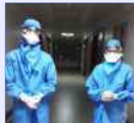
SL Raheja Hospital, Mahim, A Fortis Associate