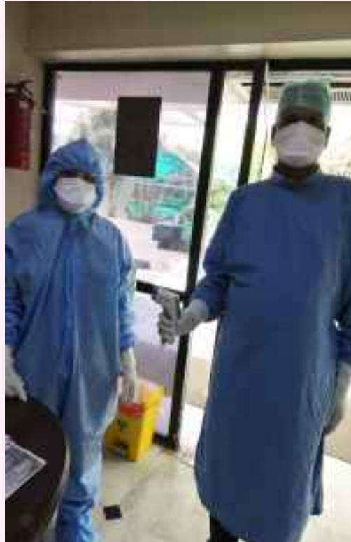
Fortis Escorts Hospital, New Delhi