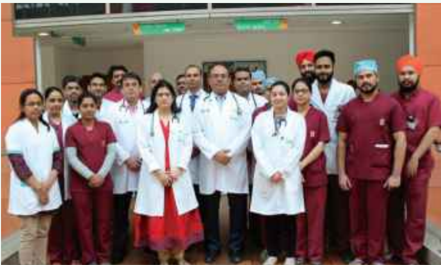
Bone Marrow Transplant Team of FMRI

The Institute of Blood Disorders at FMRI has a state-of-the-art 20 bedded Bone Marrow Transplant Unit. The unit offers both autologous as well as allogeneic transplants. It is capable of performing matched-related and matched-unrelated bone marrow transplants, and cord blood transplants. For patients who do not have donors, mismatched-related and half-matched (haplo-identical from parents) related donors are also done.