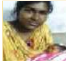
Baby of Pallaby Giri - FHKI