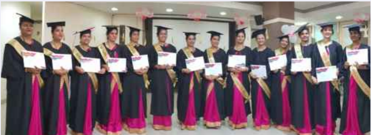
Nurse Leaders at the Nursing Leadership Programme - Jan 2019-Feb 2020