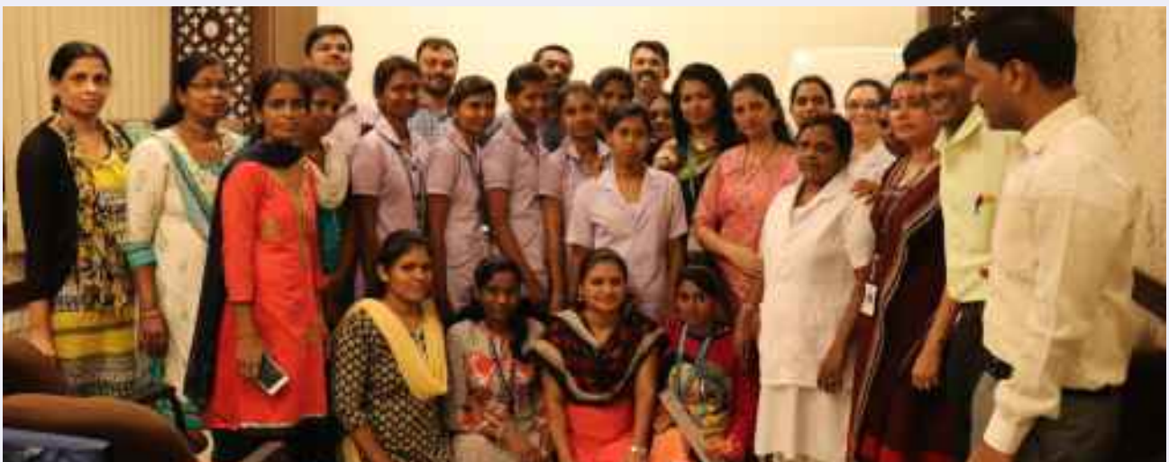
Participants and the faculty during the certification programme

MEWS is a physiological scoring system calculated at the patient's bedside by using agreed parameters. It is a tool that alerts healthcare practitioners to identify abnormal physiological parameters and triggers an escalation of care to review the patient. The training program mainly focused on escalation matrix to save the precious human life with 'track and trigger system' implementation.