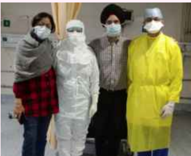
Fortis Hospital, Mohali