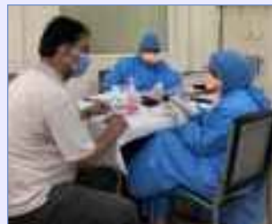
Fortis Hospital, Mulund, Mumbai