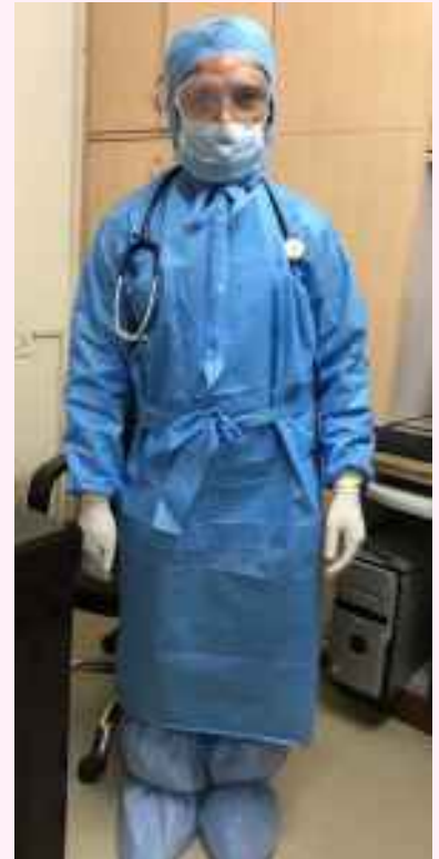
Fortis Escorts Hospital, Faridabad