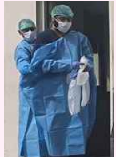
Fortis Escorts Hospital, Jaipur