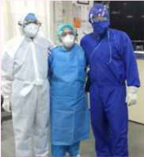
Fortis Escorts Hospital, Amritsar