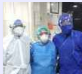
Fortis Escorts Hospital, Amritsar