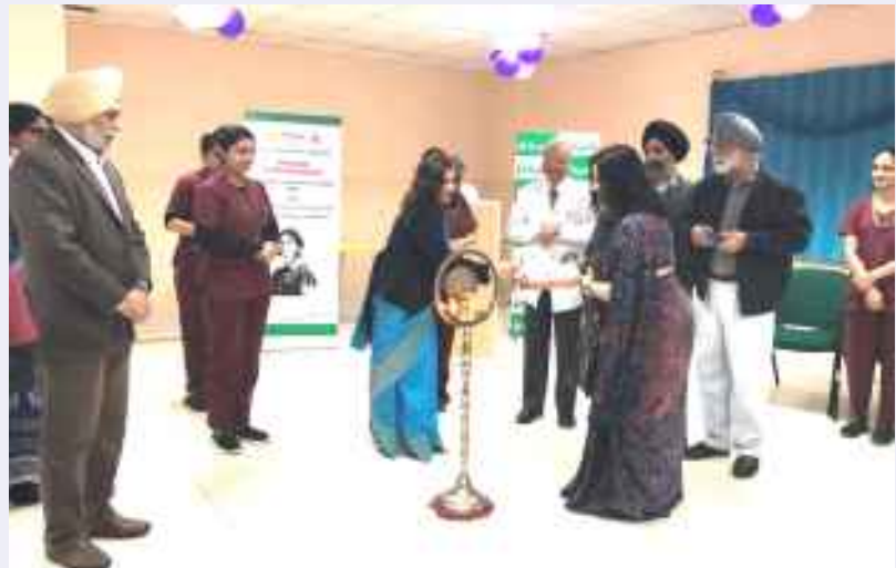
Lamp lighting in progress